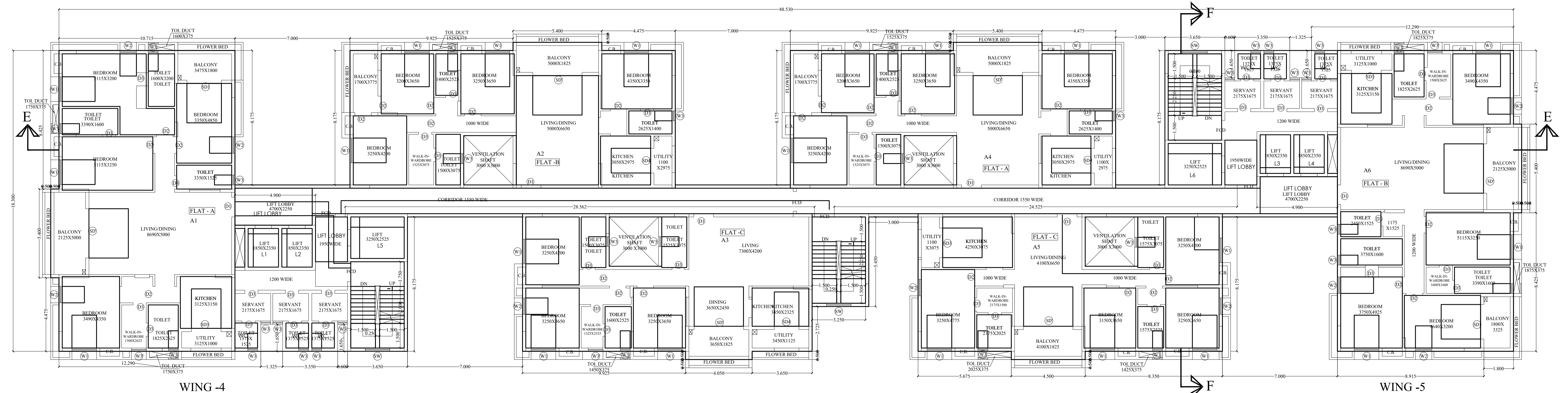
TYPICAL FLOOR PLAN (2ND TO 6TH) FLOOR02, FLOOR03, FLOOR04, FLOOR05, FLOOR06- TYPICAL